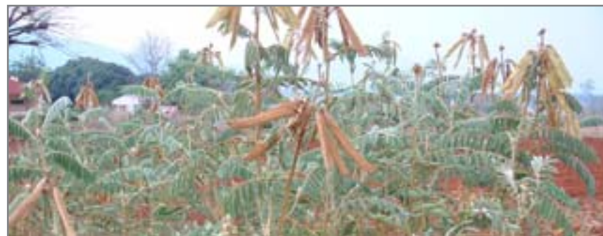
Various members of the ECHO Network wrote about the plant Tephrosia vogelii for different reasons